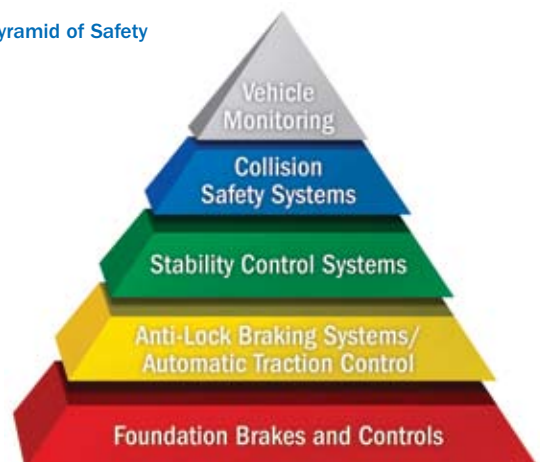
Pyramid of Safety

The system is fully integrated with Meritor WABCO anti-lock braking and Stability Control Systems Electronic Control Unit (ECU). It works in conjunction with the company's SmartTrac™ Stability Control Systems, which include Electronic Stability Control (ESC), Roll Stability Control (RSC) and Automatic Traction Control (ATC). The result is a comprehensive protection package for your driver. Your commercial vehicle. Your fleet. And the public.